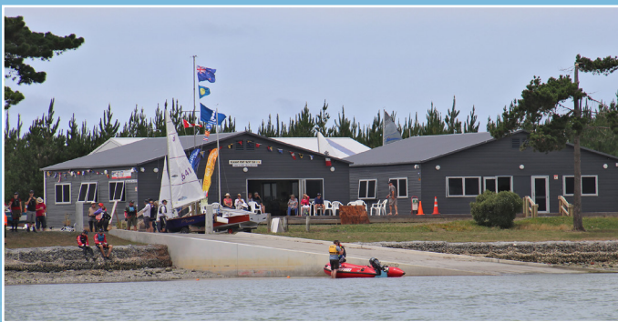
The Club's new facilities, overlooking the Estuary, make it the most modern sailing club in Canterbury.