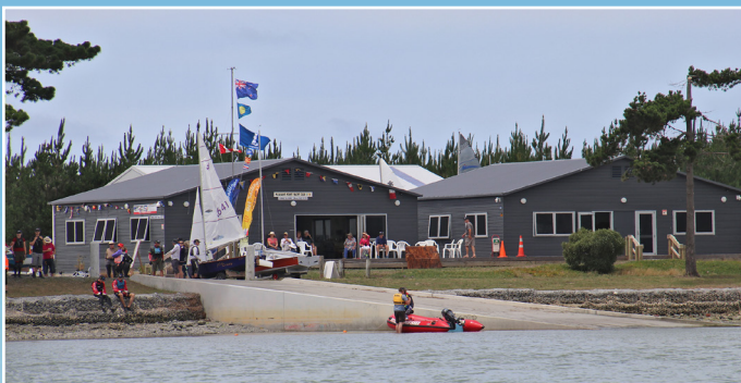
The Club's new facilities, overlooking the Estuary, make it the most modern sailing club in Canterbury.